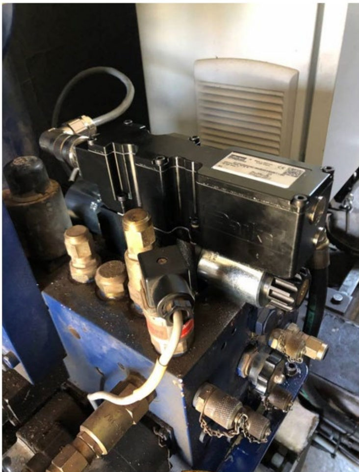
Figure 2. A well-designed pitch control valve will not only ensure stable turbine performance over its load range but will be designed to operate reliably in extreme cold and heat and will not allow dust or moisture intrusion, a known cause of valve failure.

A pitch control valve must be designed to operate 24/7 in an extremely rugged environment. First, most pitch control valves are located in the turbine hub which rotates and thus exposed to heavy vibration, shock, and rotational forces (up to 50G on three axes). The valves are also subject to lightning strikes so the valve electronics must be electrically isolated from the turbine nacelle. Also, the pitch control valve must be capable of withstanding ambient temperatures, ranging from -40C (Minnesota in the winter) to 85C (West Texas in the summer) in which wind turbines are installed. Finally, it stands to reason that the pitch control valve should be designed to comply with IP65 standards for protection against dirt, grease, and moisture ( Figure 2 ).