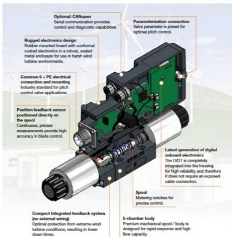
Figure 3. The Parker Hannifin pitch control valves are designed to meet the most demanding performance specifications and are configured to be “plug and play” when replacing OEM control valves.

Field service reports often cite mating connectors as the root cause of a turbine forced outage. The connectors used on OEM pitch control valves do not have locking connectors so vibration can cause the connectors to disengage. The D1FC and D3FC valve assemblies use locking mating connectors much like those found in the automotive industry that is exceptionally vibration resistant. Other important design characteristics of the D1FC and D3FC pitch control valves are illustrated in Figure 3 .